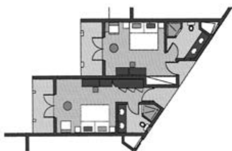
*2 layouts available for the Comfort Family rooms